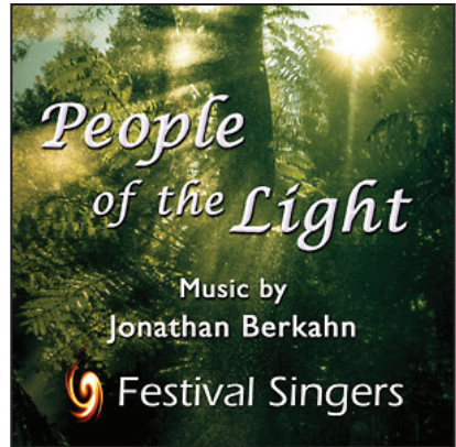
CD (2015) $20