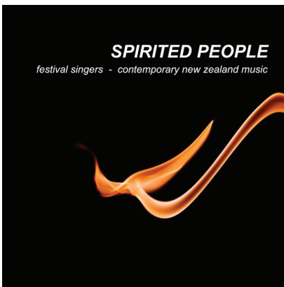
CD (2007) $20