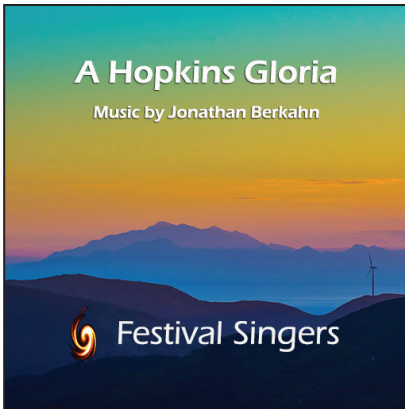
Digital Album (2020) $15